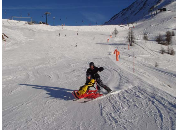
A Freewhiteski teacher and pupil on Sestriere slope

purchase ski equipment for the disabled enabling them to enjoy winter sports. The Sestriere event, fully in the spirit of ISFR, will bring together many friends from around the world who share the passion of winter sports and the Rotary spirit of "Service Above Self."