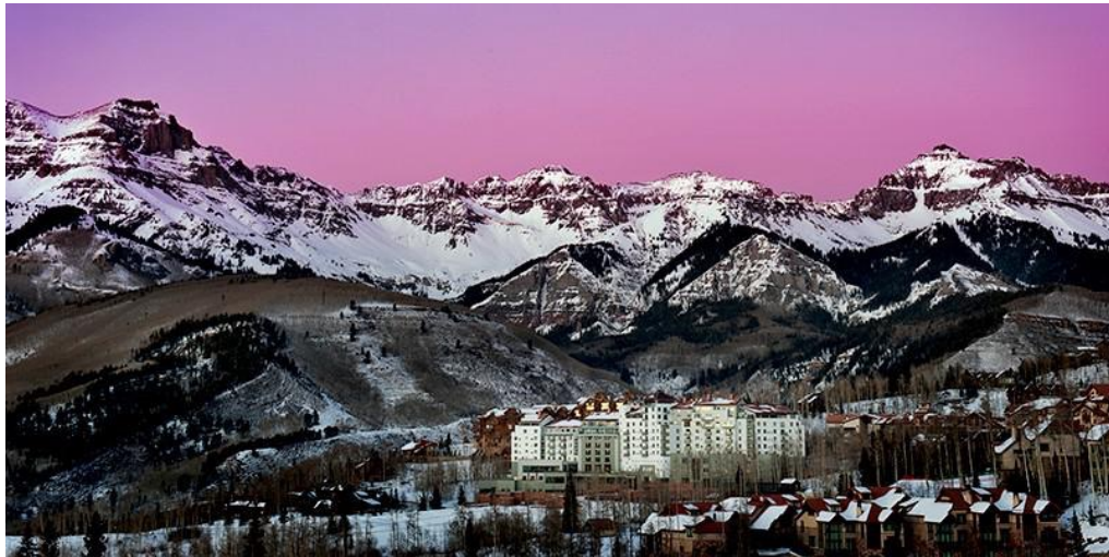
The Peaks Resort, Telluride

Room rate is $247 per night (plus a reduced $15 daily resort fee) and is also good for three days prior and three days after our actual ski week dates. The ski in-ski out location on the mountain is prime and promises to be worth the price.